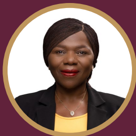
Prof. Thuli Madonsela