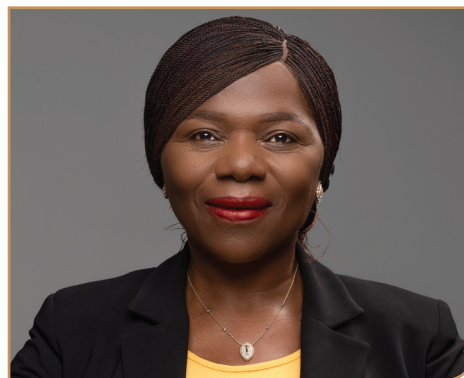
Prof Thuli Madonsela Law Trust Chair in Social Justice

Looking at the wonderful support for the #Action4Inclusion campaign, I am confident that social justice can become a reality in our country.