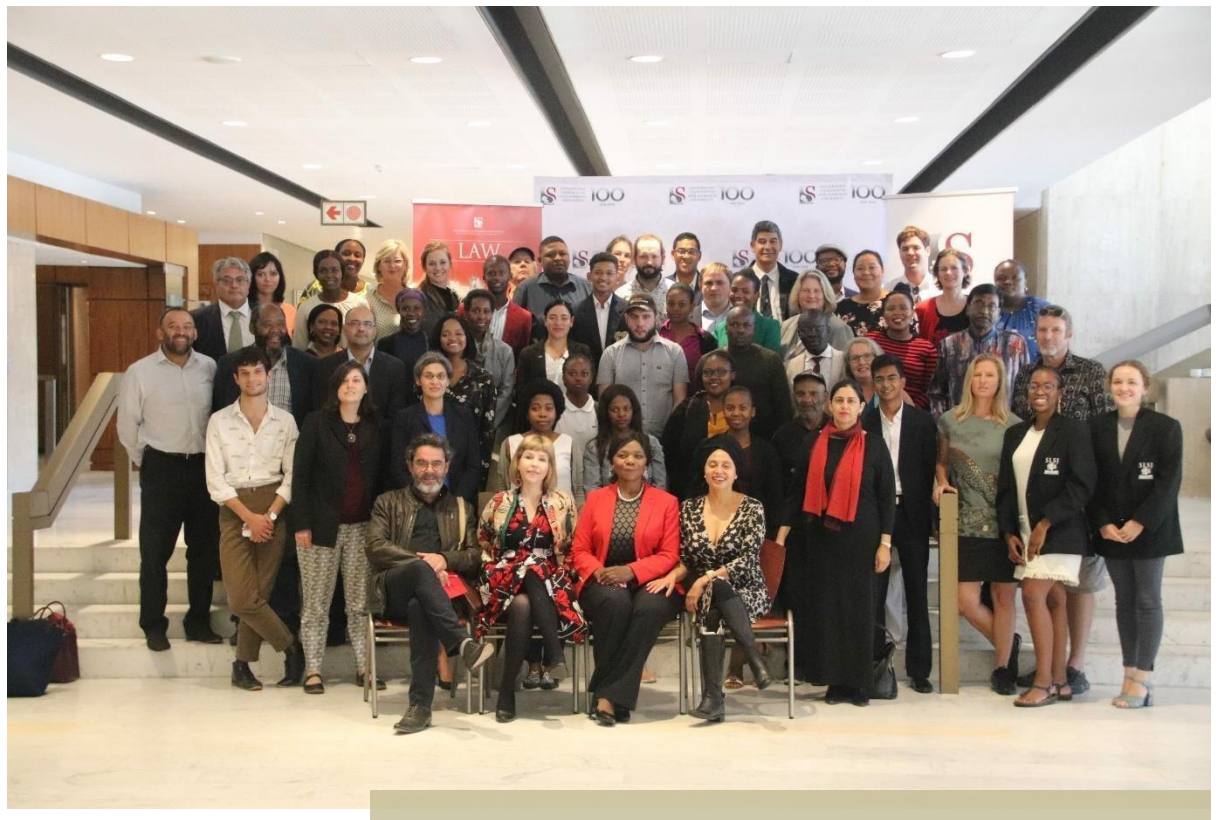
Participants at the Social Justice M-Plan Economic Dialogue

The dialogue brought together a wide range of participants from academia, civil society, organised labour, government, the private sector, and a range of organised and unorganised groups who shared thoughts on what is required to achieve a socially just and sustainable economy. The dialogue forms part of a series of dialogues aimed at building up towards a master plan that will provide the basis for policy recommendations to government.